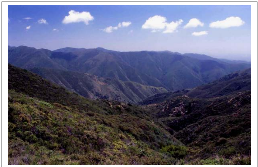
The chaparral of Trabuco Canyon where the last California grizzly bear in Southern California was killed in 1908.